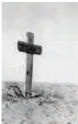
Memorial Cross at Oghratina Hill, 1916

The small isolated garrison at Oghratina had been ordered to protect a party of Royal Engineers on a well-digging expedition when, at dawn on 23 April 1916, they were attacked by over 3000 Turkish troops, including a machine gun battery of 12 guns. The defending troops repulsed the first attack but were forced back by the weight of the onslaught.