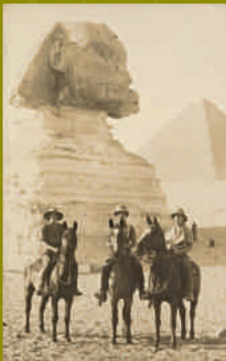
Soldiers from the Worcestershire Yeomanry, Egypt, December 1915

In April 1916 the Yeomanry Regiment was protecting the eastern side of the Suez Canal where they were responsible for patrolling the whole of the Qatia water area, a vital part of the military supply process. The three squadrons of some 150 men were based in different areas in the vicinity and with the Warwickshire Yeomanry and Gloucestershire Hussars the Brigade came under overall command of General HA Lawrence.